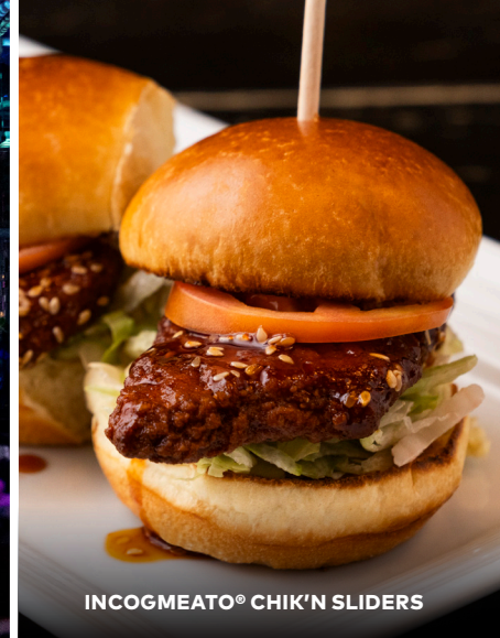
INCOGMEATO® CHIK'N SLIDERS